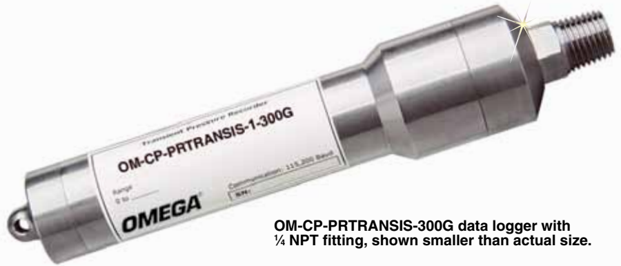
OM-CP-PRTRANSIS-300G data logger with ¼ NPT fitting, shown smaller than actual size.

The OM-CP-PRTRANSIS has been Factory Mutual certified as intrinsically safe for Class I, Division 1, Groups A, B, C and D and non-incendive for Class I, Division 2, Groups A, B, C and D. This certification makes the device ideal for use in hostile environments.